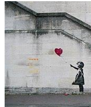
Girl with Balloon

Stencil - a piece of material with lettering or a design cut out or it through which ink or paint is printed.