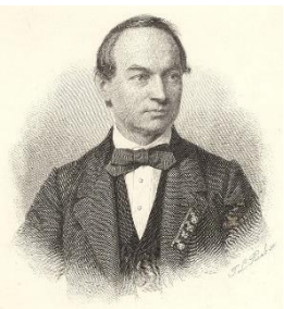
Lothar Von Faber

Pattern piece – a shape drawn to the correct shape and size to place on your cloth and cut round.